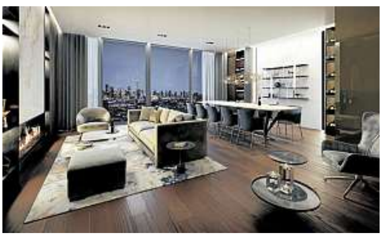
St. Clair Village will have social spaces for large and small gatherings.