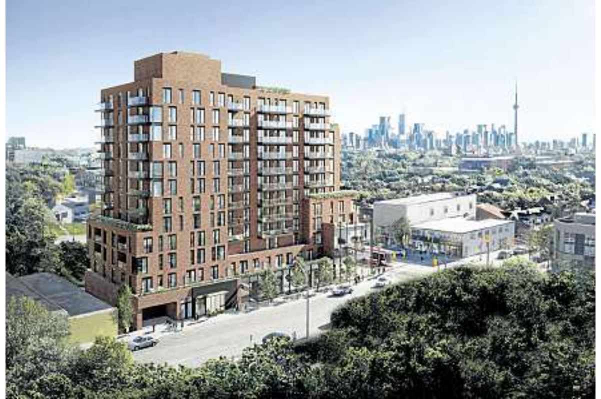
St. Clair Village is being designed to connect with the neighbourhood, and those who call it home will have one of the best views of downtown Toronto.

will be cladded in cordoven bronze and its maroon red-brick will feature dark bronze window mullions. The design is subtle in its form with vibrant tactile textures and details. The full intention behind the design is for the new development to blend in with the neighbourhood - almost like it's always been there.