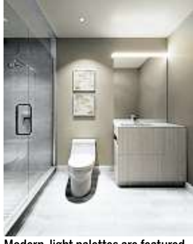
Modern, light palettes are featured.